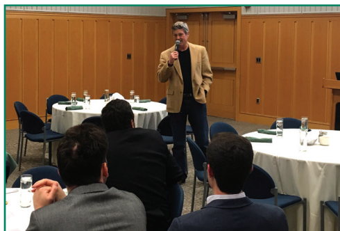
Alumni and undergraduates at Founders' Day 2016.