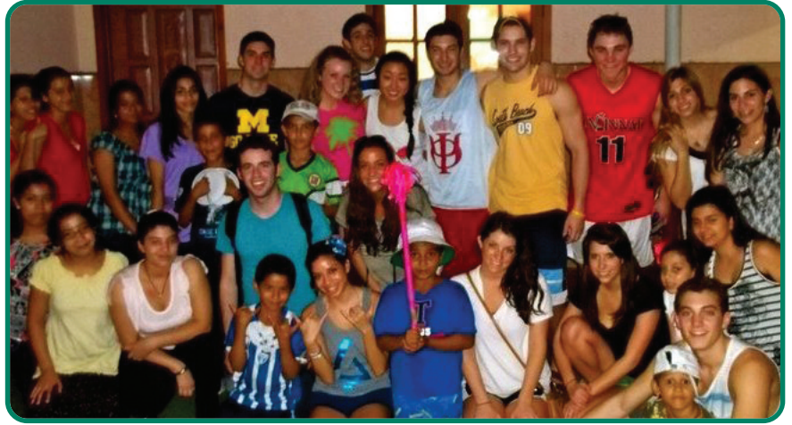
This summer, members of Michigan Alpha along with the women of Delta Delta Delta visited an orphanage in San Pedro Sula, Honduras.

This past year has been one of tremendous growth for Michigan Alpha—our academic programs are producing results, we have logged an impressive 1,800 hours of community service, and were recognized multiple times for our high standards of excellence by the University of Michigan Greek community. These joys continue to motivate us for the never-ending search for Phi Kappa Psi excellence. Coming into the fall semester we have seen our chapter G.P.A. grow for five consecutive semesters. Our current chapter G.P.A. is 3.22, higher than the all-men's average of 3.13 for the winter '11 semester. We plan to continue improving our G.P.A. this semester and into the future. All of our outstanding accomplishments are due to our outstanding membership, which at the end of last winter was 123 brothers strong. After fall recruitment we welcomed 25 new members to experience the bonds and ideals we share.