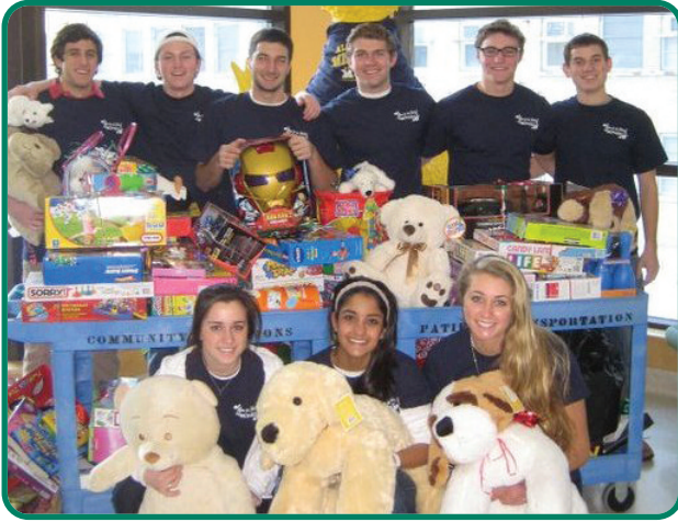
Brothers of Michigan Alpha paired up with KKG to volunteer at Mott's Hospital in 2010.

Michigan Alpha Expands Influence Beyond Ann Arbor with Worldwide Philanthropy Involvement